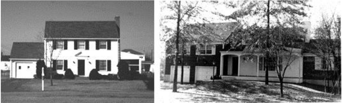
Houses at 6 North Circle, circa 1950, left; 1323 Moon Drive, 1957, right.

The family was active in the First Presbyterian Church of Morrisville.